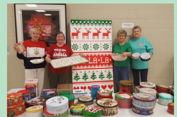
OPERATION COOKIE DROP 2018