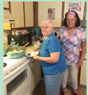
SENIOR COMPANION PROGRAM