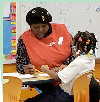
FOSTER GRANDPARENTS PROGRAM